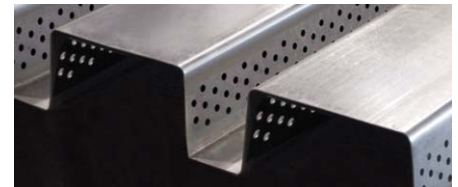
Type "N Acoustical" (long span perforated)